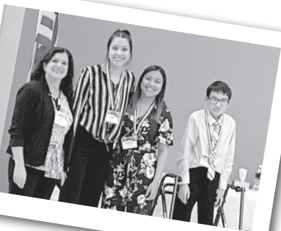
Career and Technical Education Conference, July 30-Aug. 2, Madison