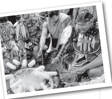
2023 South Dakota Indian Education Summit, Nov. 17-18, Huron