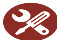
Building & Design