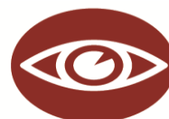
3D Visual Skills

Children and adults with dyslexia often find alternative ways of gathering knowledge and develop innovative strategies to learn, work, and achieve in life. Children and adults with dyslexia often have strong critical thinking skills and are known to be creative and have a strong sense of empathy.