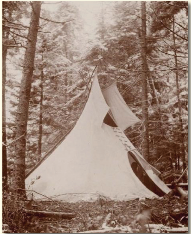
Tipi. (1884). Brule Sioux (Sicangu Lakota) Rosebud Reservation, South Dakota at the bequest of De Cost Smith [Photograph]. Smithsonian-NMAI. Used with permission.

Free Translation: We are honoring all those relatives who have gone to protect our freedom. (Individual's Lakota name) I remember my friend. They have been all around the world. (E. Bullhead 2012)