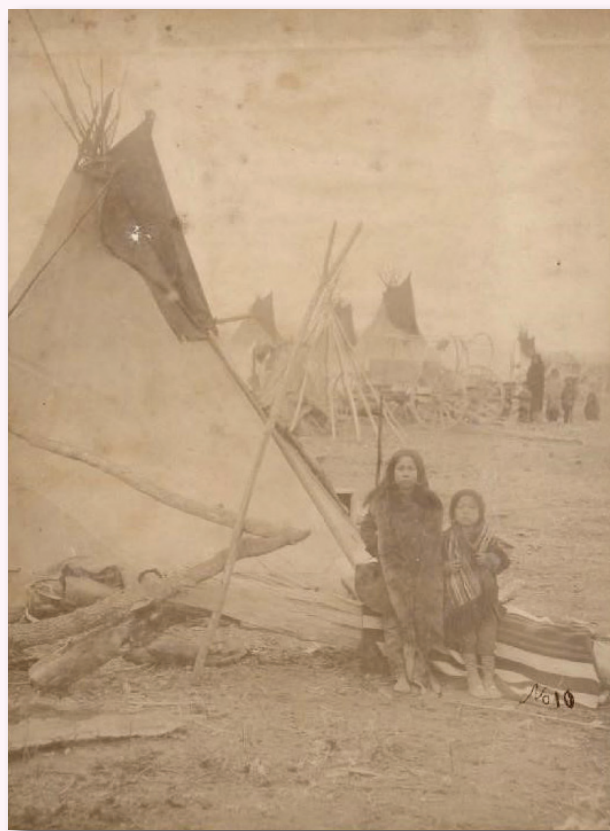
Two youngsters outside tipi (Note long otter breastplate on boy (r.) and (trade) Navajo blanket on ground, Pine Ridge Agency