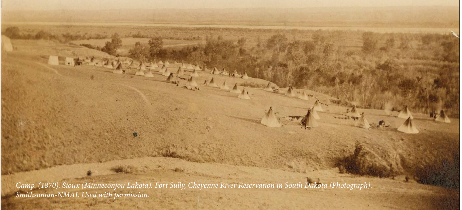
Camp. (1870). Sioux (Minneconjou Lakota). Fort Sully, Cheyenne River Reservation in South Dakota [Photograph].

SD OSEU aligned social studies lessons can be accessed at: www.wolakotaproject.org/lessons-sd-social-studies-standards .