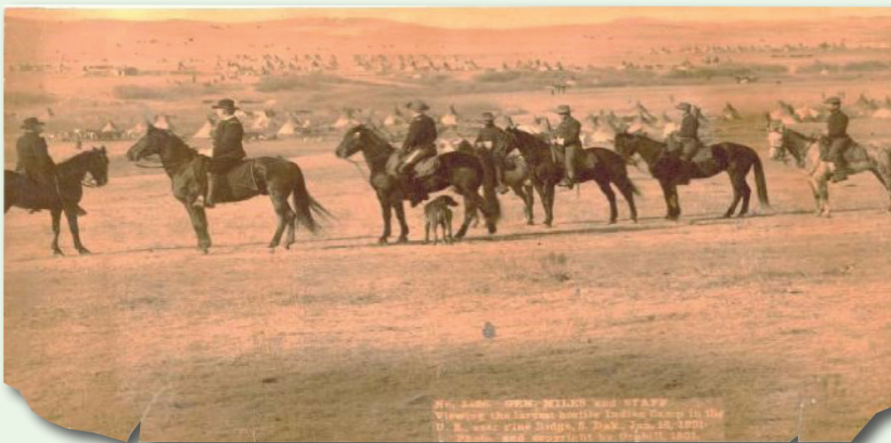
Albumen print of soldiers on horseback looking at numerous tipis in distance, entitled “Gen. Miles and staff are viewing the largest hostile Indian camp in the U.S. near Pine Ridge, S.D.”

Currently, historical perspective, oral tradition and written accounts about the Oceti Sakowin are being revisited and examined for accuracy, validation, and inclusiveness. The Oceti Sakowin people have long integrated literacy into their culture, and yet did not sacrifice their high regard for their historical oral tradition.