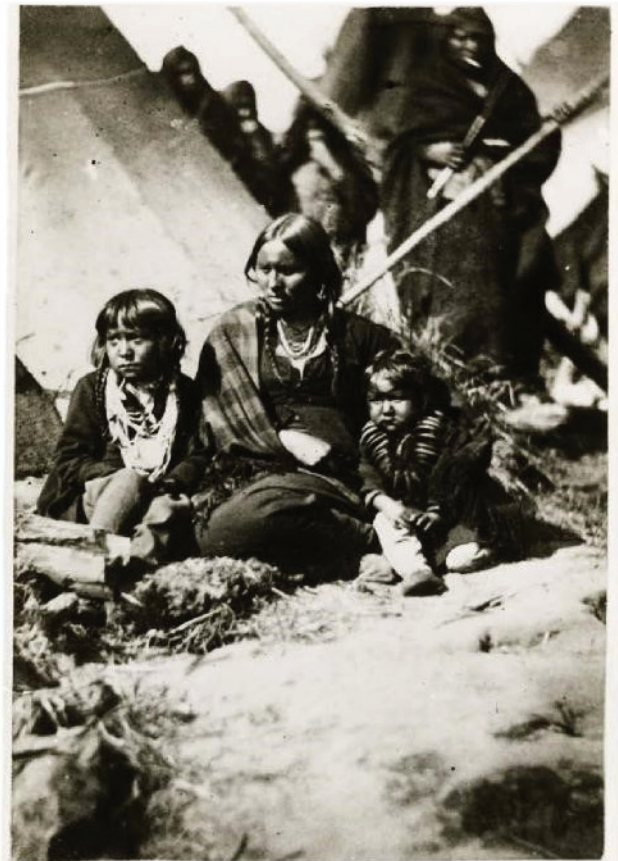
SIoux PRISONERS. (Wife and Children of Condemned Sioux Chief.) From Martin's Gallery of Indian Portraits, St. Paul.