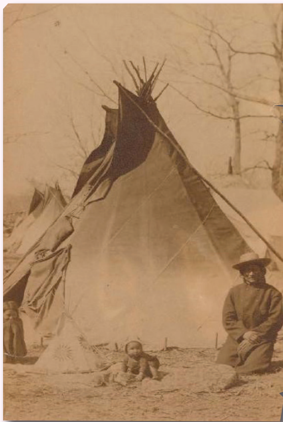
left: Infant is playing. (n.d.). Infant is playing with toy in front of tipi. Fort Sully, Cheyenne River Reservation, S.D. ca. 1870. [Photograph]. Smithsonian-NMAI. Used with permission.