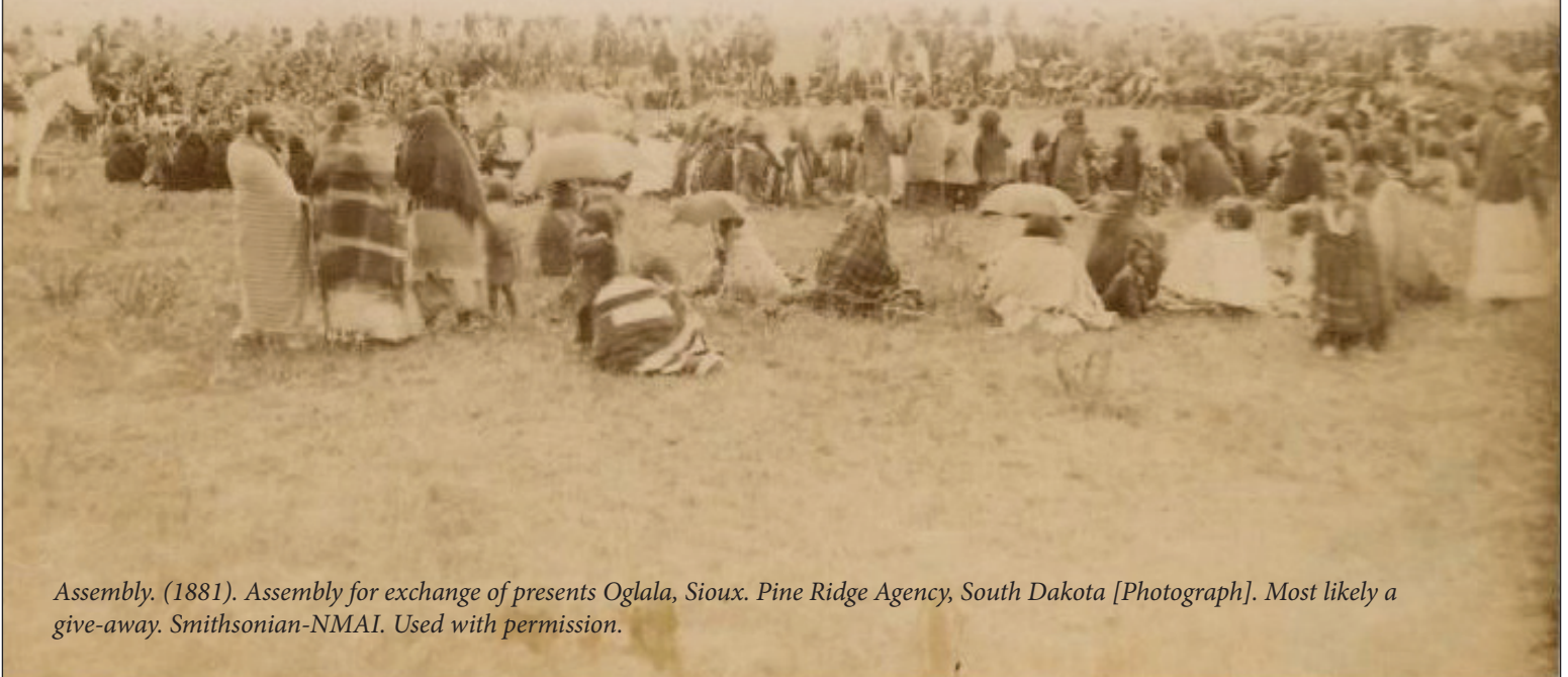
Assembly. (1881). Assembly for exchange of presents Oglala, Sioux. Pine Ridge Agency, South Dakota [Photograph]. Most likely a give-away.