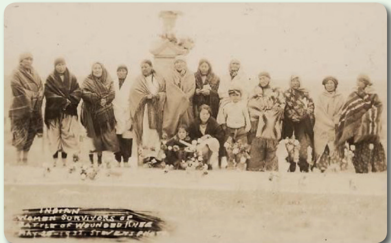
Stevens. (1932). Women Survivors of Wounded Knee at cemetery, May 25, 1932. View of a group of female survivors of the Wounded Knee Massacre, posed in front of the monument at the Wounded Knee cemetery honoring the dead of the Massacre on 29 December, 1890. They are posed with children, floral tributes, and American flags. The monument was erected in 1903 at the site of the mass grave of victims, by surviving relatives to honor the "many innocent women and children who knew no wrong..." who were killed in the massacre [Photograph]. Smithsonian- NMAI. Used with permission.

Free Translation: Custer came to count coup, but the Lakota/Dakota were already counting coup. The Long Knives are crying counting coup. (E. Bullhead 2012)