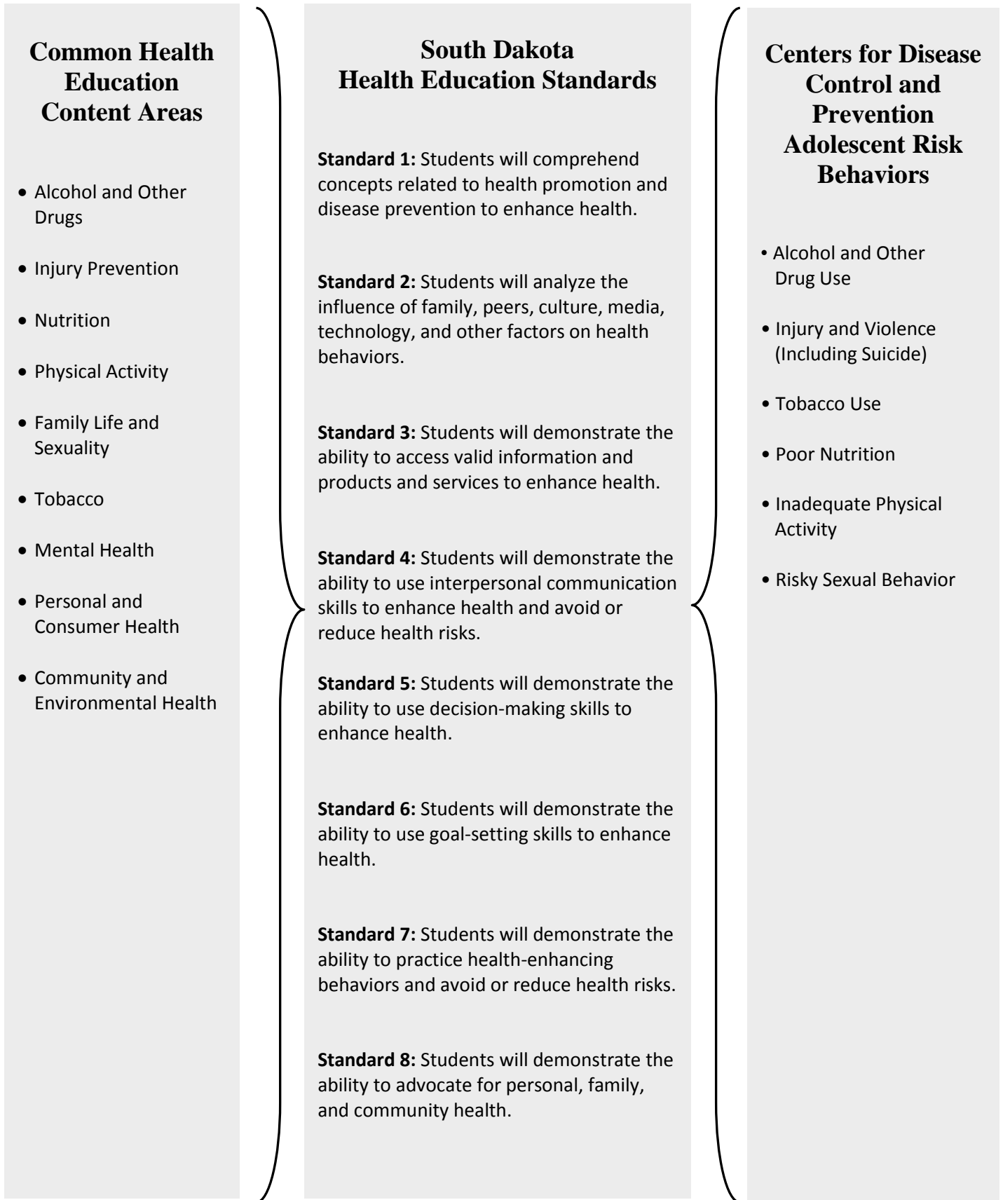
Table 1.2 Relationship of common health education content areas and Centers for Disease Control and Prevention adolescent risk behaviors to the South Dakota Health Education Standards.