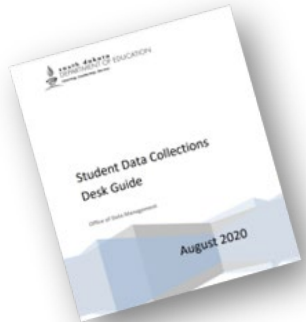
Student Data Collections Desk Guide, pg 76-79 Image is hyperlinked