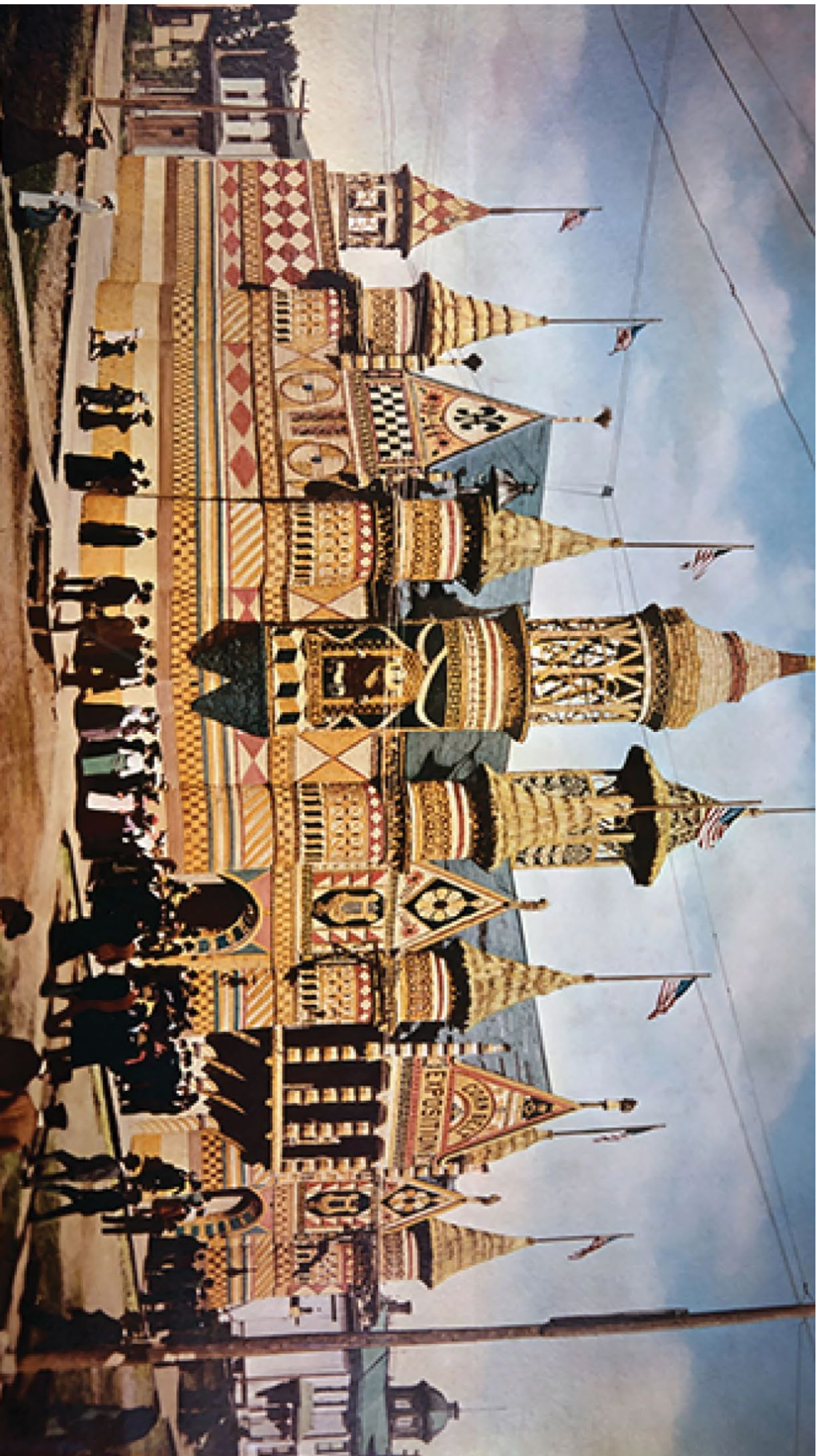
South Dakota Public Broadcasting