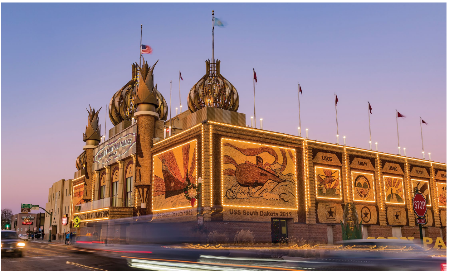
South Dakota Department of Tourism.

So why build a corn palace in the first place? Well, back when the country was being settled by European farmers, there was a strong sense that the Great Plains—stretching from Montana and North Dakota to the north all the way to New Mexico and Texas to the south—had an image problem. When the army sent explorers into this region in the early 19th century, they called it the “Great American Desert.” Stephen Long said it was “unfit for cultivation,” and Zebulon Pike said it reminded him of the “sandy deserts of Africa.” Now, if you’re a settler bringing his family west to farm, those aren’t encouraging words. So, as long as land was available on either side of the Great Plains, you would prefer to settle there. As the railroads traversed the Great Plains, though, new towns were established every so many miles to provide for train depots and refueling stops, and those communities needed settlers to homestead those lands.